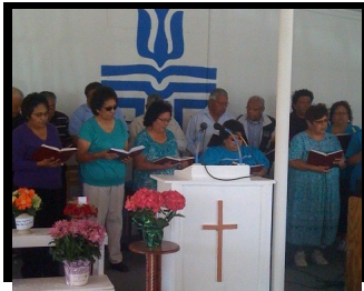
Ft. McDowell Presbyterian